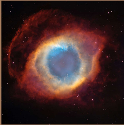
Eye of God Nebula