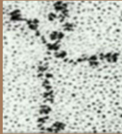
Laminin – Cell Adhesion Molecule

https://www.universetoday.com/46685/the-eye-of-god/