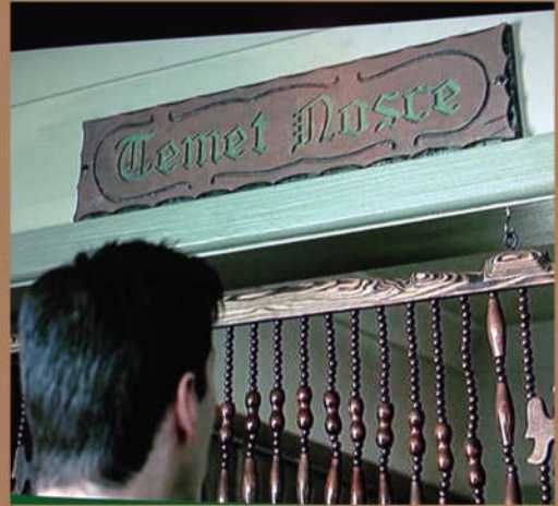
Image from The Matrix . Dir. Andy Wachowski and Larry Wachowski. Warner Bros. Pictures, 1999. DVD.

“In his grace” – operational power of God